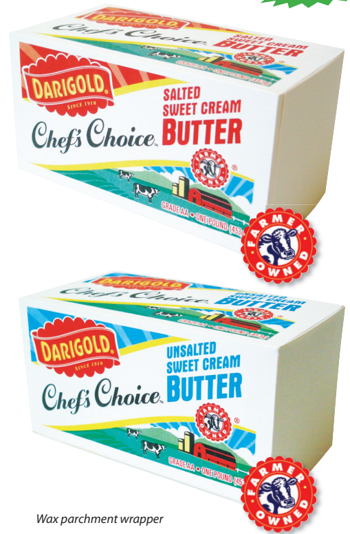
Wax parchment wrapper

Following the vacuum chamber, the butter continues on through the final working section, where salt is incorporated, moisture content is adjusted, and the final working occurs to achieve a smooth dense texture.